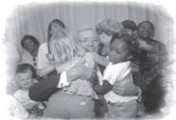
Governor Don Sundquist has made welfare reform and improvement of services to families two of the top priorities of his administration. He is shown here with some of the children now served by the state.

TN KIDS training begins this spring, and as the system evolves, SWORPS will provide continuing education to TDCS employees. The SWORPS staff working on the TN KIDS curriculum (seven of whom are UTCSW alumni) will also integrate TN KIDS into the pre-service training that SWORPS now delivers to new TDCS staff (for more information about TN KIDS, access the TDHS website at http://www.state.tn.us/youth ).