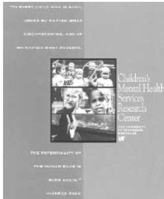
For more information about the Children's Mental Health Services Research Center, visit the Center's website at http://social33.csw.utk.edu/

The Center recently assisted two junior UTK College of