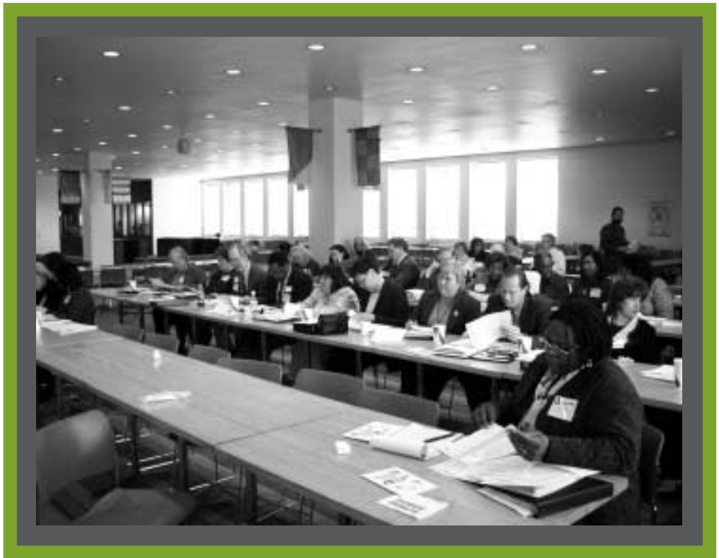
Family Services counseling staff members from across the state met on February 22 for intensive training.

The initial success of this program is based on the comprehensive partnerships established between DHS staff members, SWORPS coordinators, and community counseling agency staff members who