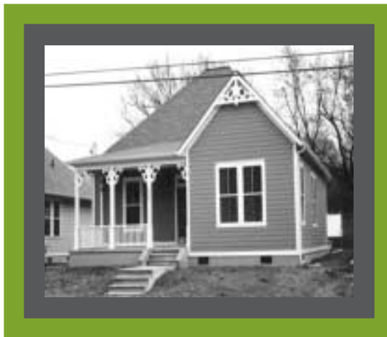
One of the seven new houses that have just been completed.

The community's hope is that revitalization will bring in private businesses such as grocery stores, fulfilling residents' needs and further redeveloping the neighborhood.